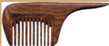
Braiding Comb, 7 1/4" long, 11 teeth, for braiding.