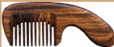
Vest Pocket Comb, 7 1/4" long, 11 teeth, works for everyone.