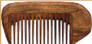
Palm Comb, 5" long, 16 teeth, suitable for purse or pack.